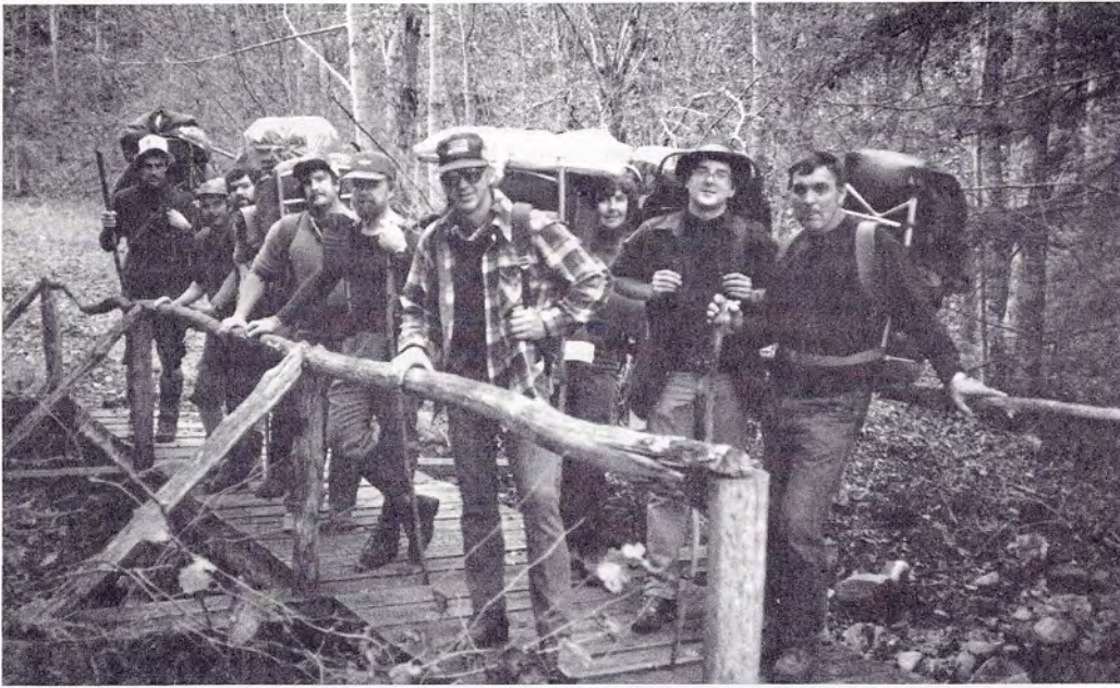
On Camp Carson Bridge.