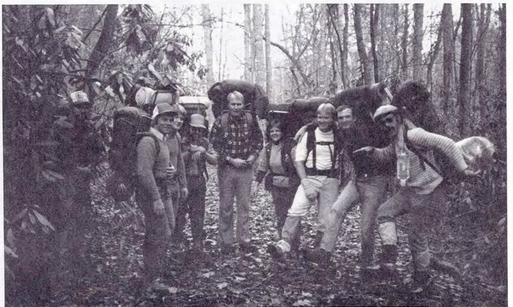
On the trail again . . .