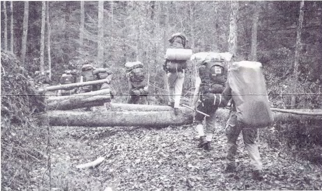
Starting out on the trail.