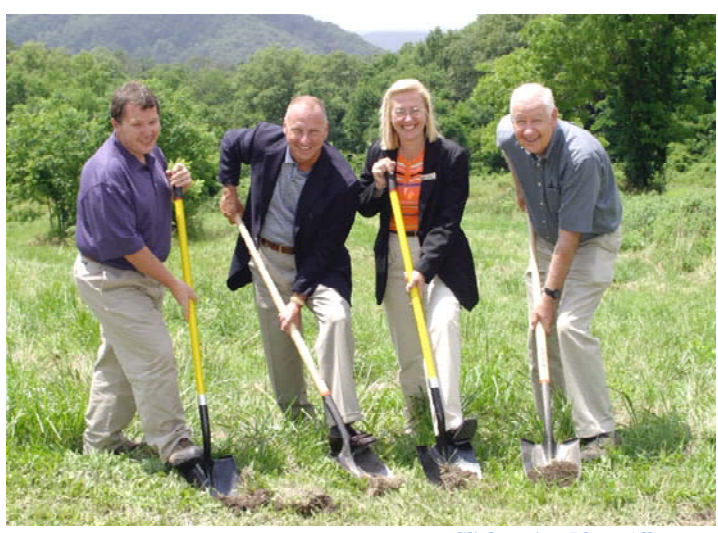
Click to view Photo Album