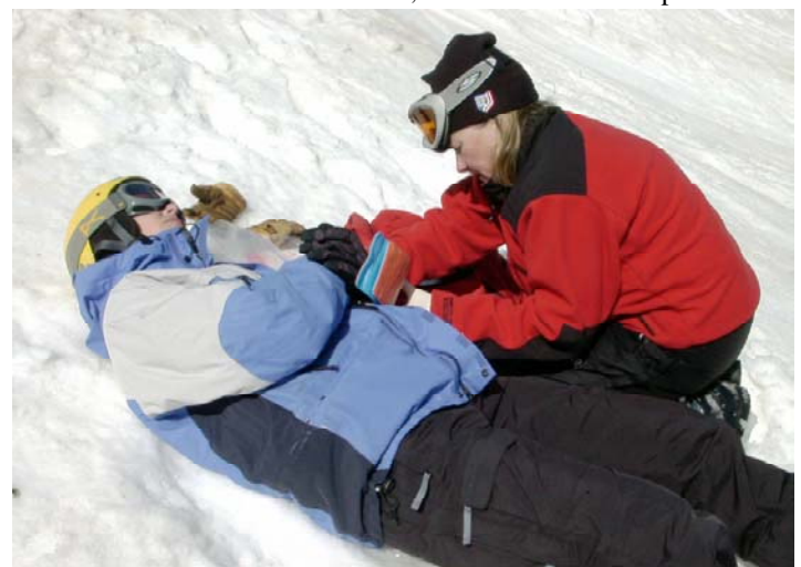
Click to view Photo Album

complete the process this year. With this in mind, one of our primary goals for the 2003-2004 season is to have at least three new candidates begin the Certification process. Three clinics will be offered at various locations around the Division-Virginia (Massanutten), West Virginia (Snowshoe) and Smoky Mountain (Ober-Gatlinburg). Please check the Division Calendar for dates and contact information. The goal of these clinics is to provide advanced training for potential candidates as well as to increase the knowledge of other interested individuals. This is a great way to increase your overall knowledge of the "Big Picture" of Ski Area Management. Topics include Snowmaking, Grooming, Signage, Lifts and Lift Safety, Ski Area Management, Avalanche Beacon Searches, Advanced Sled handling techniques, and Advanced OEC scenarios. I look forward to seeing lots of new faces!!