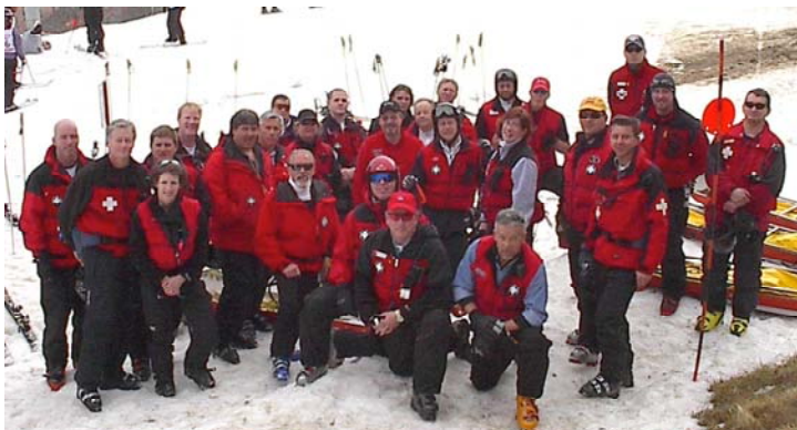
The Blue Ridge Senior Clinic was held at Beech on January 6.