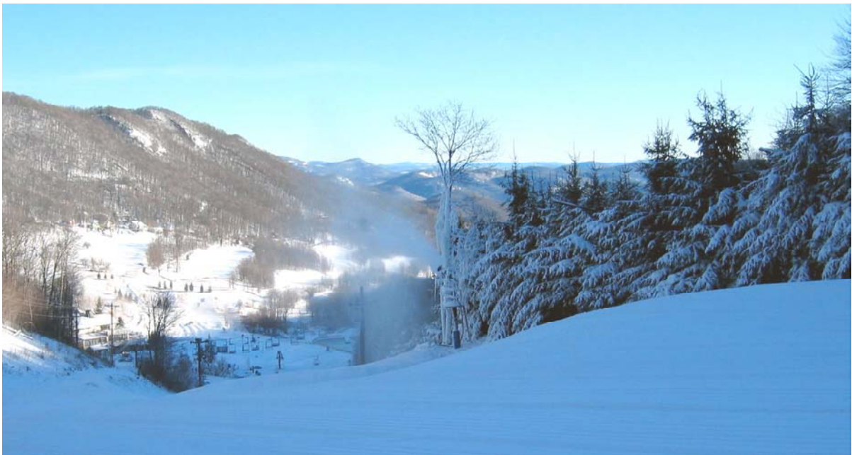
Goshawk at Hawksnest—After the snow, before the opening.