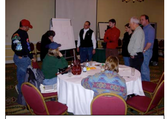
Working in teams, PES students had the opportunity to design their "dream" patrol room/treatment area. There were many innovative ideas as the creative juices flowed. Some designs included ample storage and lockers for all patrollers, a deck with hot tub, built in oxygen systems and many other interesting approaches to providing great patient care.

In listening to the many questions and other exchanges during the program, it appeared that much was learned by all attending.