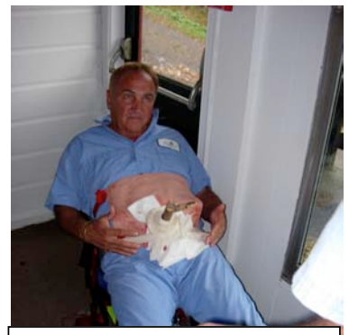
At one refresher, a skier had run off the slope into the woods and been impaled on a stick. This was an excellent opportunity for practicing several critical skills.

This season, a great deal of emphasis is being placed on training throughout the region. There are many great opportunities for patroller's to gain new knowledge and skills in order to better serve their patrol and area.