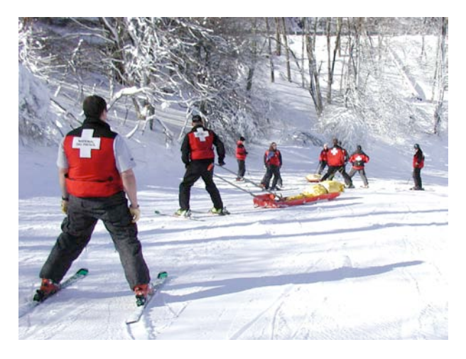
(Toboggan Recovery Wheelbarrow Drill)