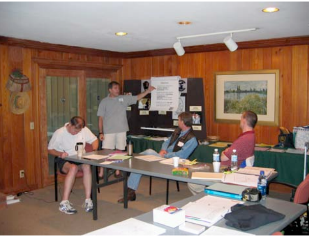
Instructor Development class in Atlanta, GA (Roswell, GA) with students from Cataloochee, Cloudmont and Sapphire Valley. The Instructors were from Beech, Cataloochee, Cloudmont, and Hawksnest. Class was held at the Chattahoochee River Environmental Education Center.