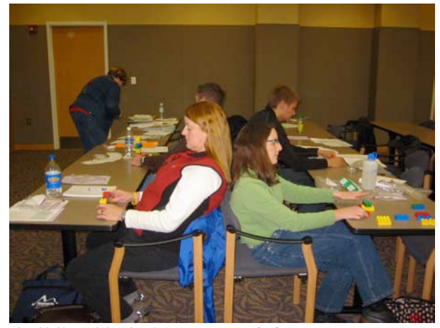
Instructor Development students and instructors using building blocks in Boone, NC @ Watauga Medical Center April 14, 2007