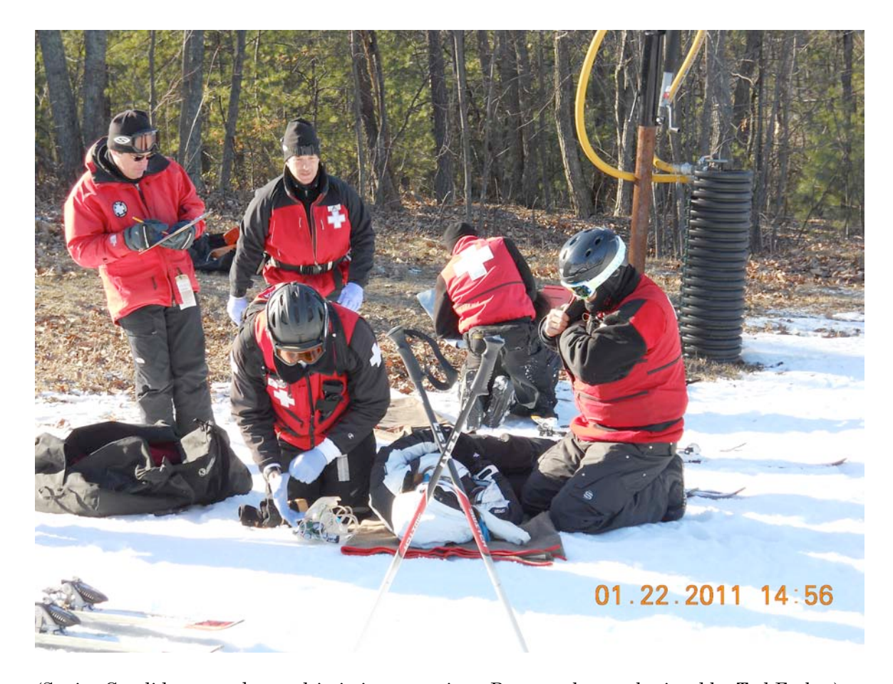
(Senior Candidates work a multi-victim scenario at Bryce –)

Because it's fun, and because we are all the types of folks who are achievers. So personal satisfaction plays a huge role ... but there is another reason. A Senior patroller, with refined skills and a broader perspective, is a real asset to mountain management. And let's face it; if it weren't for our resort management team, we would be doing what we all love to do. So I'll leave you with a question – what are you doing to make sure you provide your mountain with the greatest asset you can be? Maybe the Senior program is one way you can answer that question!