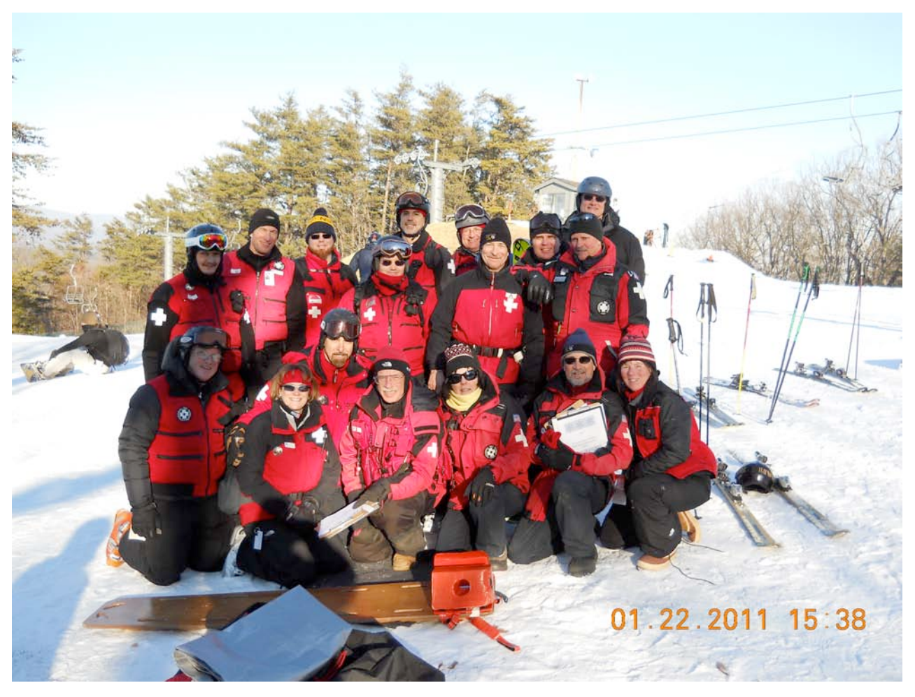
Virginia Region 2011 Senior candidates and evaluators

Senior candidates negotiate a toboggan slalom course at Wintergreen