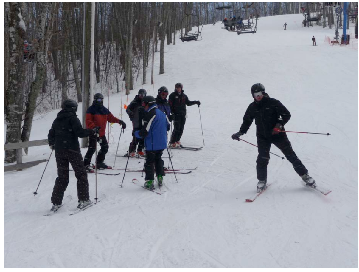
On the Snow at Cataloochee