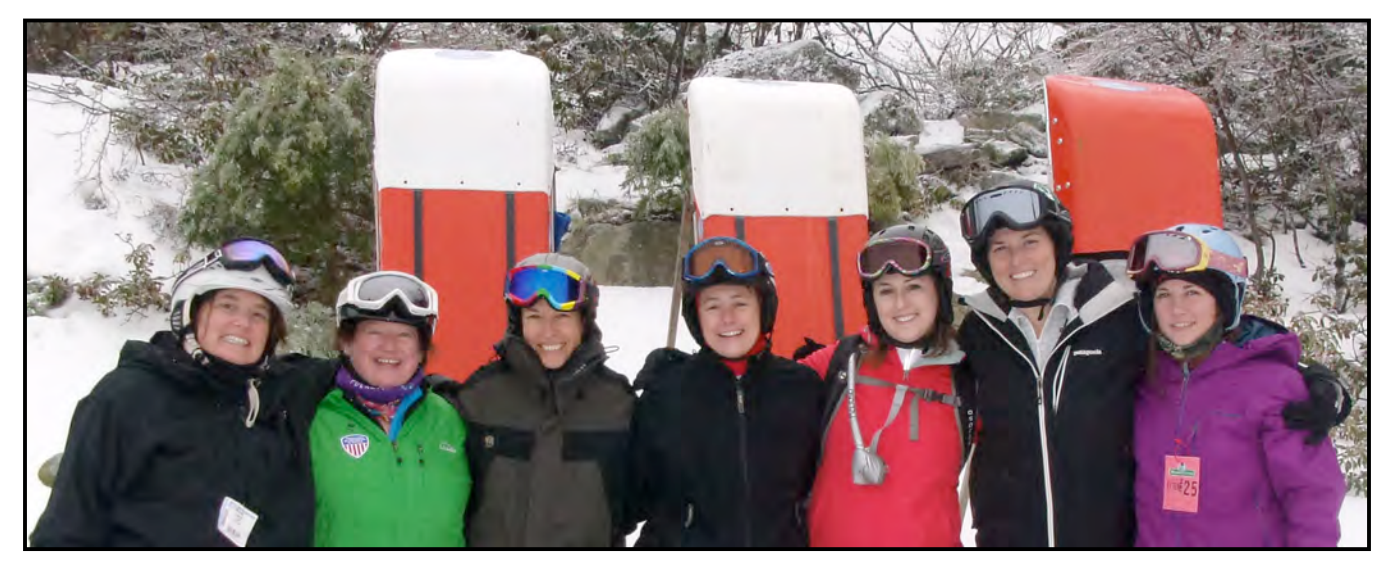
Cataloochee Participants (above)