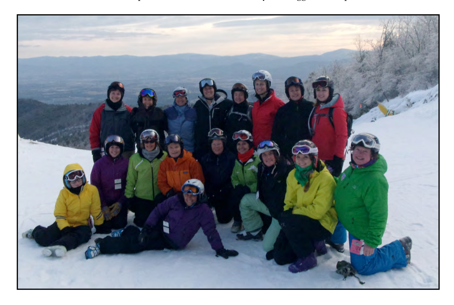
Sunday's Toboggan Participants (below)