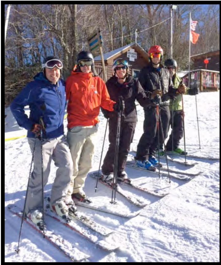
Photo below-PSI Southern Director Clinic at Timberline