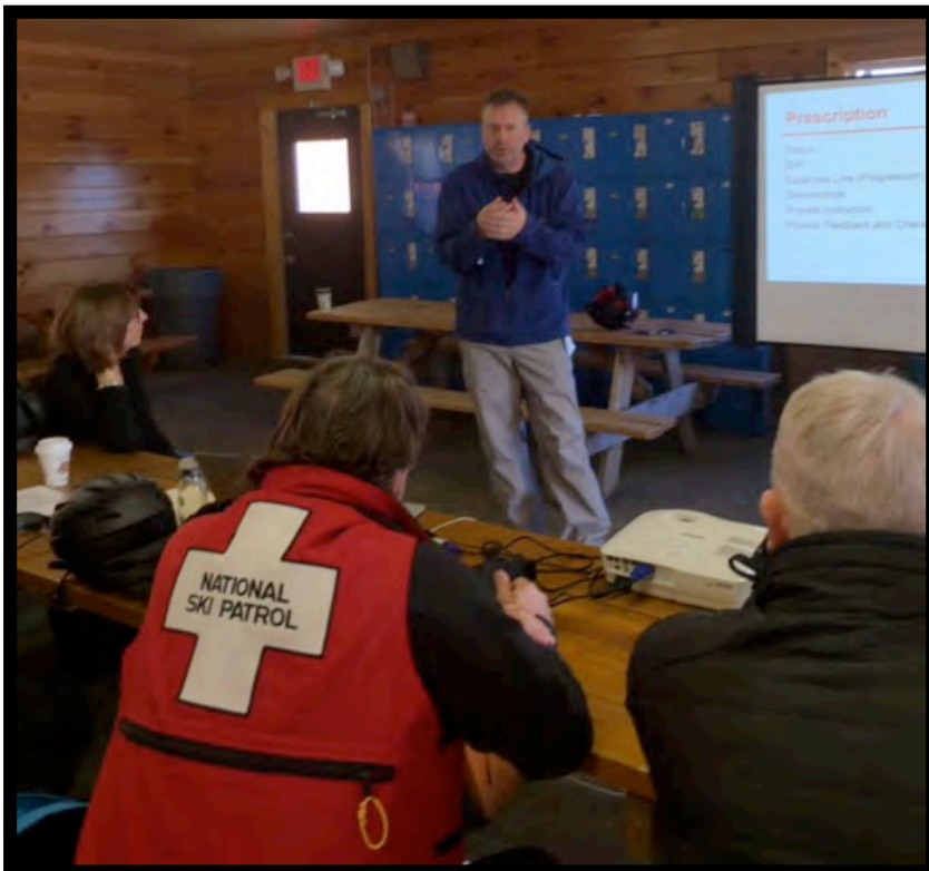
Photos on left ST Clinic at Cataloochee December 2014