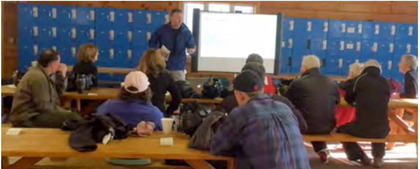
Photo above ST Clinic at Cataloochee December 2014