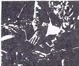
Battery Jumper Cables let you start cars with weak batteries.