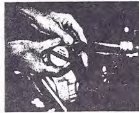
Plastic Tape works on both hoses and electrical wiring.