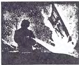
Fire Extinguisher (Dry Chemical Type) puts out minor fires.