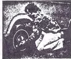
"Fix-a-Flat" inflates and seals tires quickly, cleanly, easily.