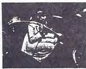
Siphon Hose for emergency tank-to-tank siphoning of gas, water, etc.