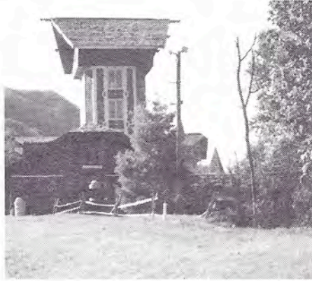
Beech Mtn. ski area in the fall.