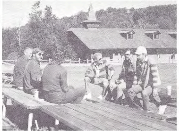
Break time at officers meeting.