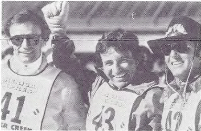
Jean-Claude Killy, Jimmie Heuga and Billy Kidd have skied in the USA Express and serve on the Board of Directors for the Jimmie Heuga Center, a non-profit organization "Reanimating the Physically Challenged." SM