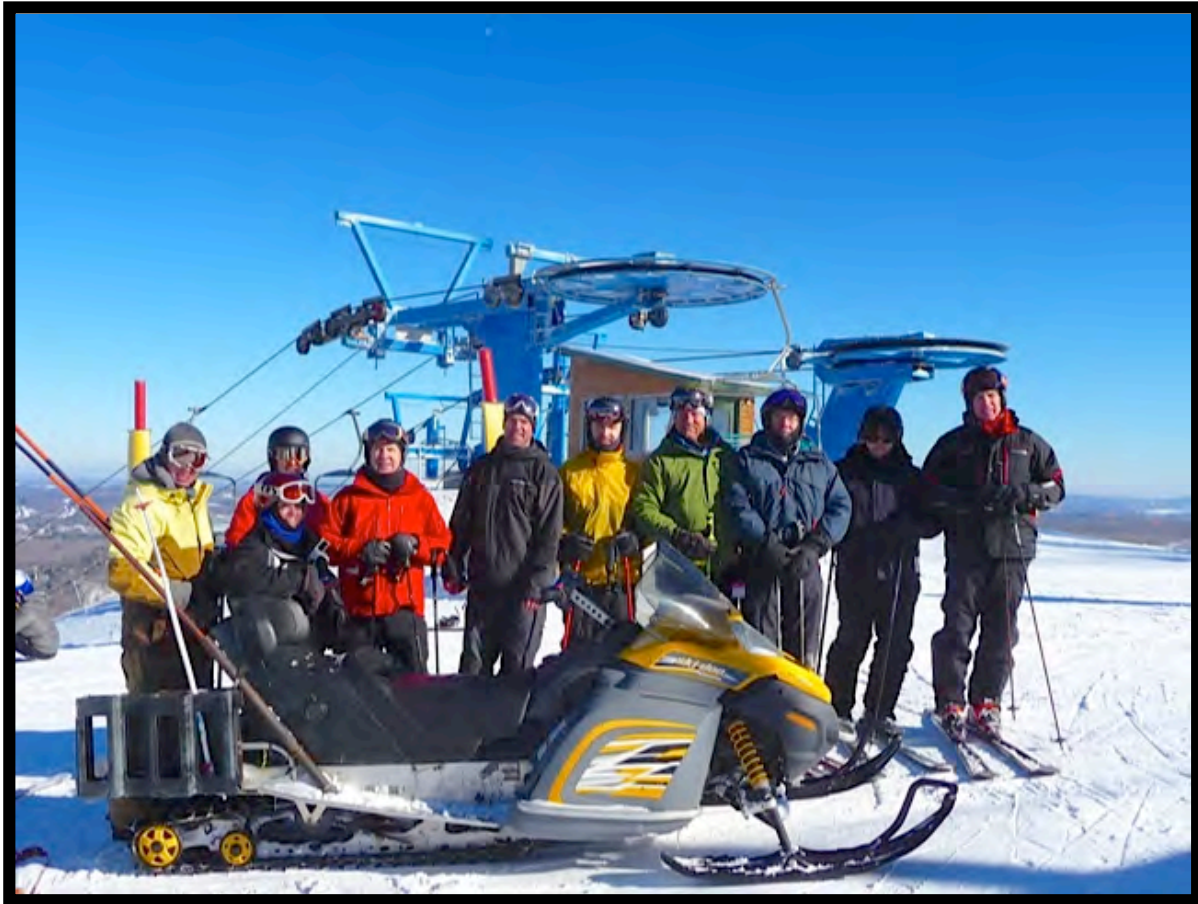
Winterplace Clinic Skiers