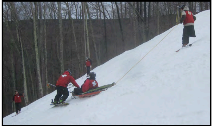
Loaded sled on Lower Shey's Revenge