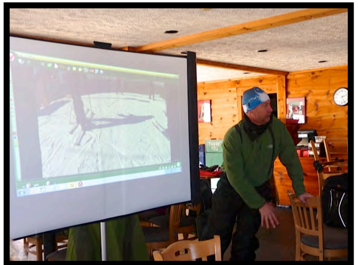
Group listens to National S&T Supervisor as he performs movement analysis on the clinic participants.