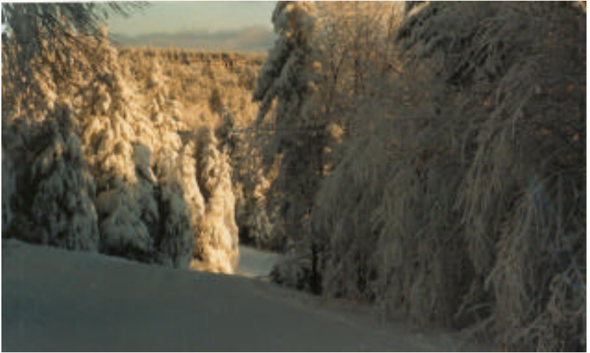
Snowshoe, WV; 1989

The Southern Cross is published three times a year, fall, mid-winter and spring. Articles and photos are encouraged and appreciated. With photos, please include caption information. If at all possible, please include a photo of author with articles. Deadline for spring issue is May 25, 2002. Send submissions to: Bob Weed Southern Cross Editor 2609 Willena Dr, Huntsville, AL 35803 256-882-9604 weedra@home.com