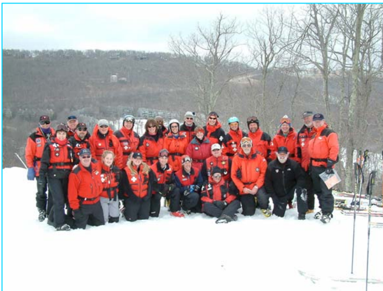
The Virginia Region Senior S&T Evaluation was held at Wintergreen on February 21

Recently the Executive Officers of the Division along with the Board of Directors met at the Spring Officers Meeting in Boone, NC to begin planning for the coming ski season. During those sessions, the draft regional training calendars were put together. As you will see from the attached calendar, there are many great training programs