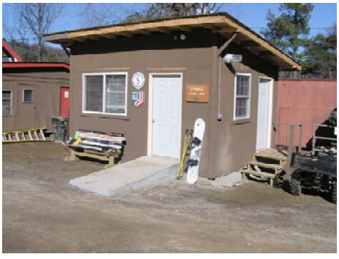
Click to view Photo Album