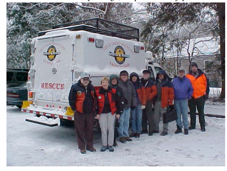
Click to view Photo Album

In other news from the Deep South Region, we now have three Mountain Travel and Rescue instructors—two of them are Instructor Trainers. In our efforts to revive the Mountain Travel and Rescue (MTR)