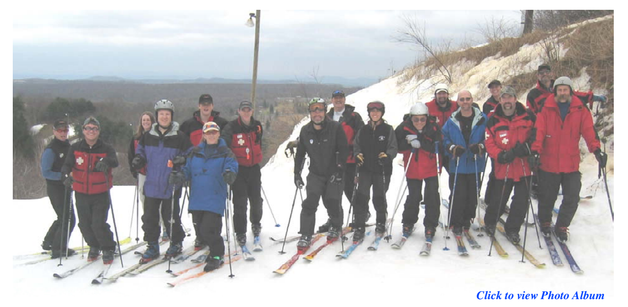
The "Free Heel" clinic was held at Winterplace on January 4. About half the class members were first time free heelers. "A flopping good time was had by all"

park is new and improved on Spruce Glades and features the most rails in the region. The patrol has reinstituted their Junior Patroller program and look for good things to come of this move. It's the beginning of the year and the Snowshoe Patrol has already set a record, they will have Five—count 'em, five—new patrollers entering the certified program this year, a record for the patrol, congratulations. And the winner of the "all the slopes open before the Christmas holiday" award goes to Silvercreek, the only resort to have all its slopes open before Santa Day!